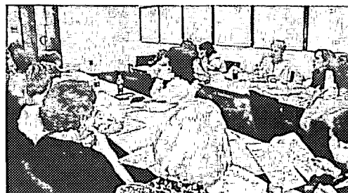
Participants at the Hall County Library Systems bi-monthly Gardening Lunch and Learn series.

Hall County Library System started a book wish list of titles that the library would like to have, but due to budget cuts could not afford. The books were listed on the amazon.com website and also lists were given to two of the local bookstores. To date over 40 new books have been donated to the library. A link to the list is available on the homepage of the library system and books are shipped directly from Amazon to the library making donations very easy for patrons. The books can also be donated in honor or in memory of someone. While this is not a replacement for collection development, this has been a great supplement to it and a wonderful public relations tool.